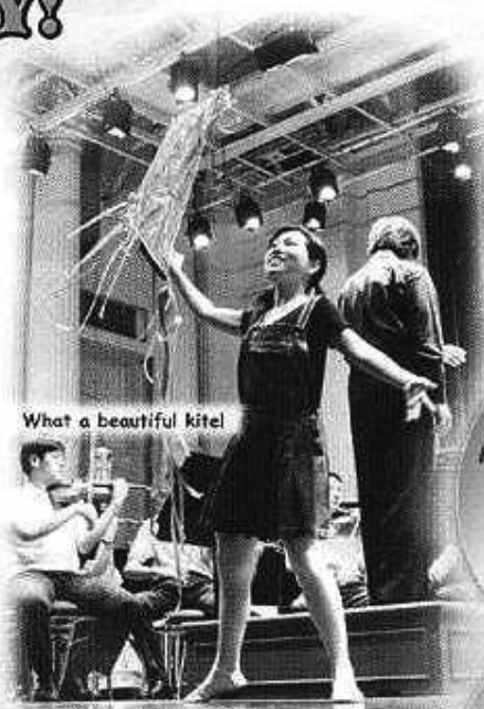
What a beautiful kite!