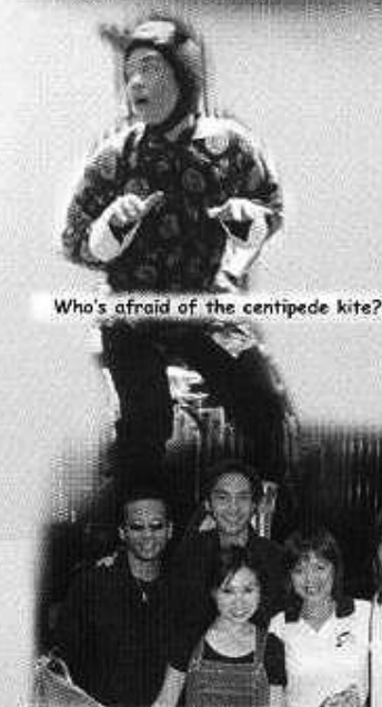
Who's afraid of the centipede kite?