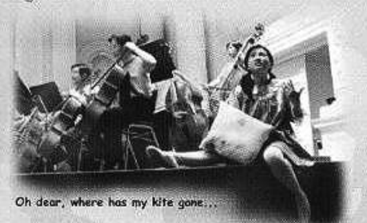
Oh dear, where has my kite gone...